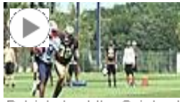
Patriots host the Saints at training camp