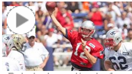
Pats last practice before first preseason ga...