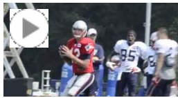
Patriots skirmish at scrimmage