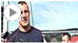
Patriots Rob Gronkowski after Saints pra...